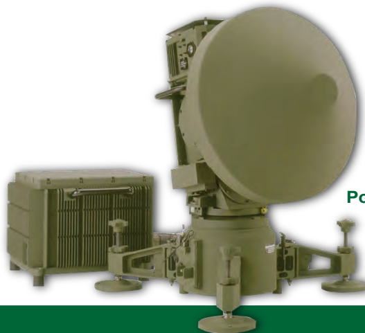
Portable Ground-based Unit